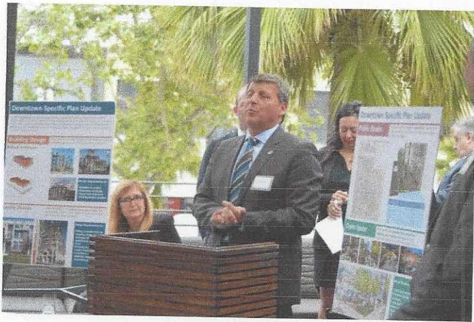
City of Glendale Mayor, Ara Najarian